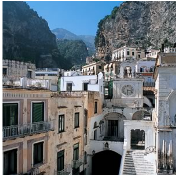
The Collegiate Church of Santa Maria Maddalena

From Piazzale Spiaggia the road winds its way up through the town to Piazza Umberto I where there is a stone fountain dating from 1927. To the north stands a wide flight of steps opening onto a small 19th century atrium which leads to the churches of the Immacolata and San Salvatore de Birecto, whose origins date from the 10th century and played a fundamental role as a Palatine chapel in which the crowing ceremonies of the Dukes of Amalfi once took place.