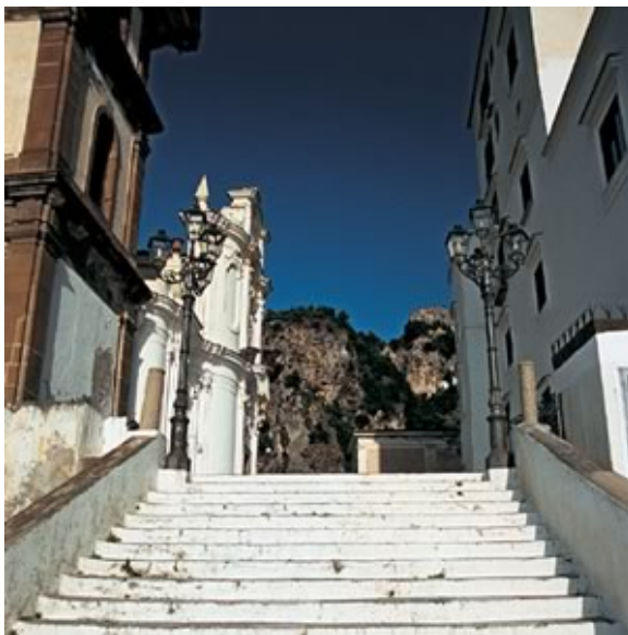
The Church of San Salvatore